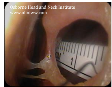
Figure 2: Nasal septum perforation. A ruler has been inserted into the opposite nostril to demonstrate scale.